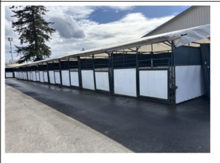
Option 2: Outdoor Stalls

(*may be shared) in stalls S8 for $75.00 per stall.